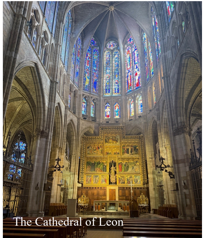
The Cathedral of Leon